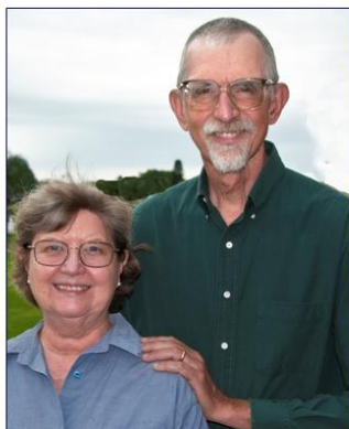
He is a long term Habitat for Humanity volunteer