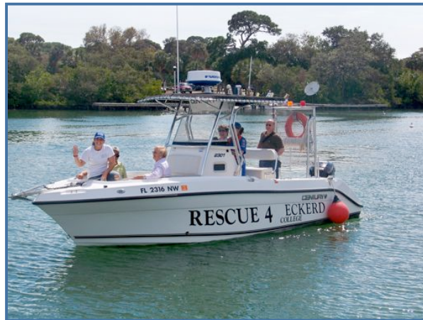
Kira Moyer '13 having fun on Rescue 4